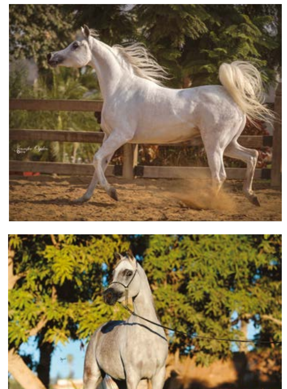
Dana Al Baydaa (Jamil Al Rayyan x Gawaher Al Baydaa) Bred and owned by Al Baydaa stud, Egypt

Sondous Al Baydaa (Jamil Al Rayyan x Ansata Bint Samiha) Bred and owned by Al Baydaa stud, Egypt